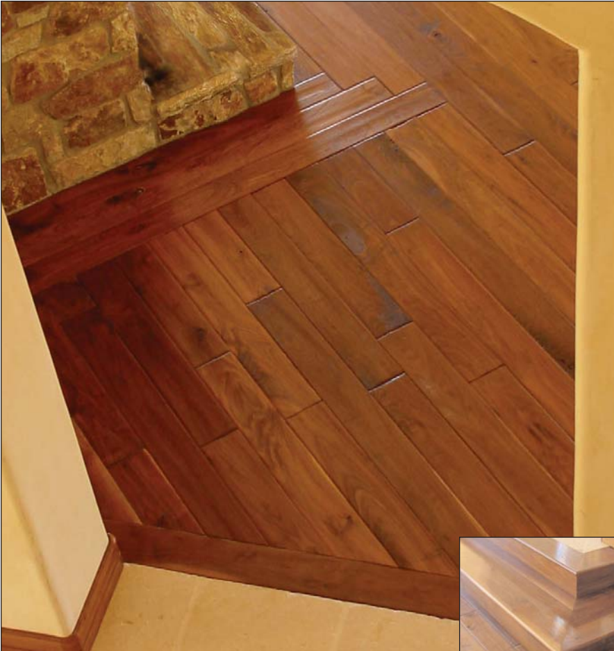
Distressed wide-plank walnut.